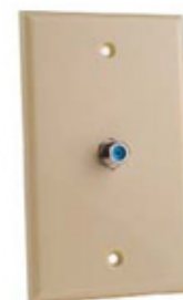
Coaxial Wall Cover w/ Plate

All items packaged in bags of 100 units.