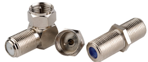
Coaxial Connector / Terminator

All items packaged in bags of 100 units.