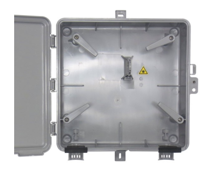
Fiber Interface Terminal (FIT)