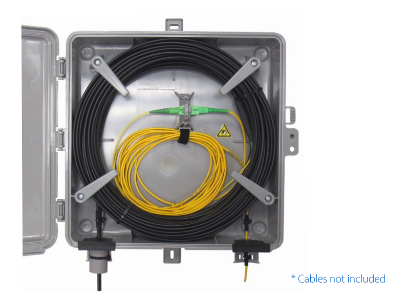
Fiber Interface Terminal (FIT) with Cables Installed