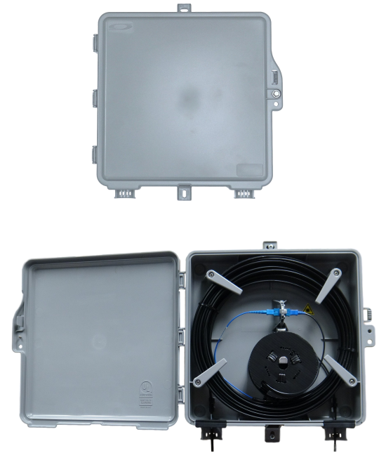
Fiber Interface Terminal (FIT) with spool

This durable enclosure is designed for outside plant environments and incorporates innovative design features that help prevent the ingress of water and dust. The enclosure size is 12.2" x 12.2" x 3".