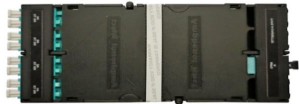
Fig. 3: HX8 Base-8 MPO Breakout