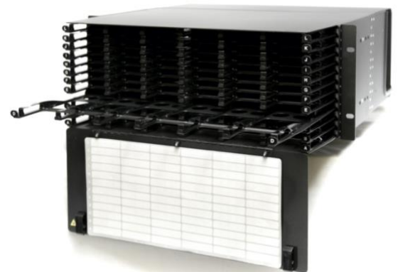
Fig. 6: 4RU Chassis (front)