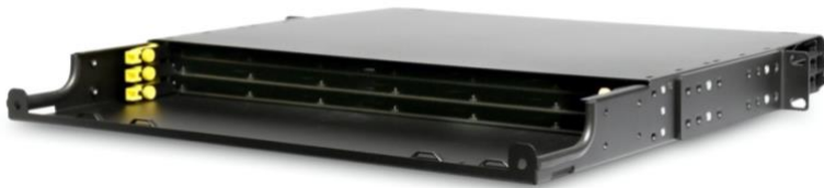
Fig. 4: 1RU Chassis (rear)