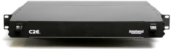
Fig. 1: C2E 1RU Chassis

The C2E chassis provides a solution that is dense, modular and tray based. It is offered as either a dedicated Base-8 solution using the C2 Base-8 modules for MPO or MTP breakout modules, or a dedicated Base-12 version.