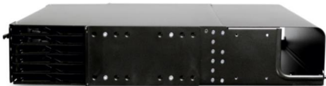
Fig. 5: 2RU Chassis (side)