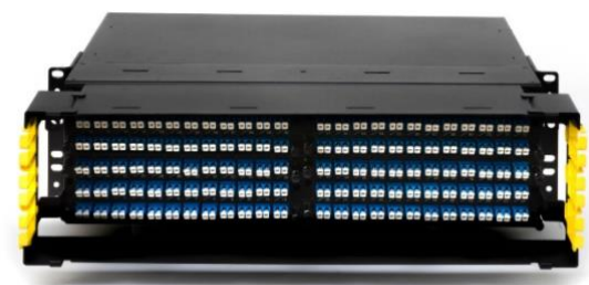
Fig. 2: C2X open 3RU patch chassis