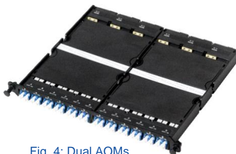
Fig. 4: Dual AOMs