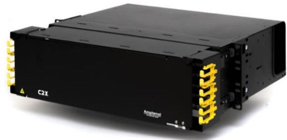
Fig. 1: C2X 3RU chassis

The C2X™ chassis is a streamlined bulkhead solution capable of deploying the Advanced Optical Modules (AOMs). Available in multiple configurations to use as patch, patch/splice, pre-terminated or modularly deployed in any mix of the C2 AOMs. The C2X chassis can provide up to 432 LC connections in a 4RU panel.