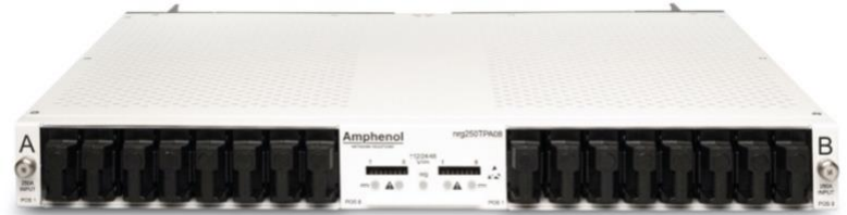
Fig. 1: nrg250TPA08-SENS-16 Front View

This platform provides front access to alarm enable/disable switch configuration for uninstalled TPA fuse locations. Also featured are front LED indicators for power/fuse alarms, monitoring status, rear connections for form C relay alarms, and optional nrgSMART connections.