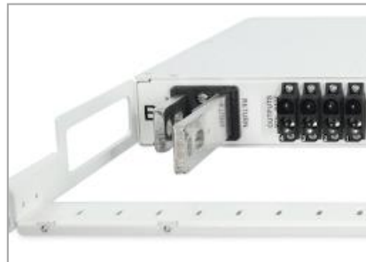
Connectorized/Horizontal Input "-C"