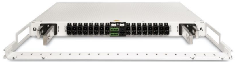
Fig. 3: nrg250TPA08-C-16F Rear View