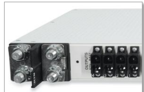
Connectorized/Stud Input "-SC"