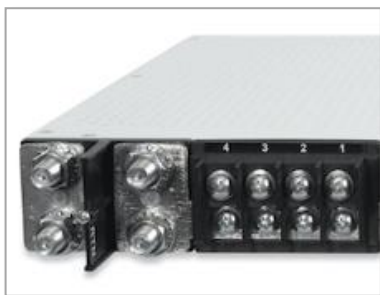
Stud Input/Lug Output