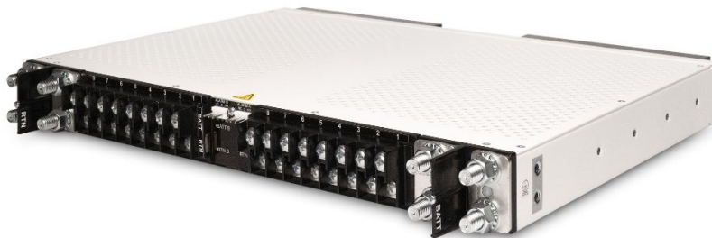
Fig. 2: 300CB08 Rear View

This platform provides front access to alarm enable/disable switch configuration for uninstalled breaker locations. Also featured are front LED indicators for power/breaker alarms, monitoring status, rear connections for form C relay alarms, and optional nrgSMART connections.