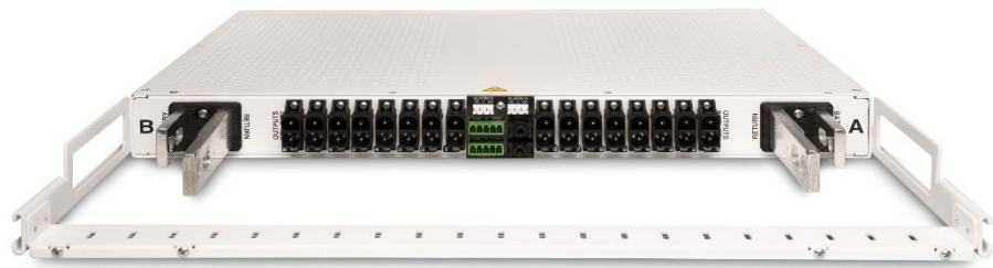
Fig. 3: nrg300CB08-C Rear View