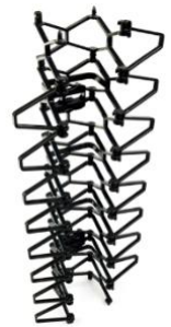
Fig. 1: FLX2-1FT