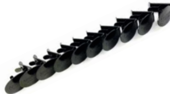
Fig. 4: FLX2-LATCH-10